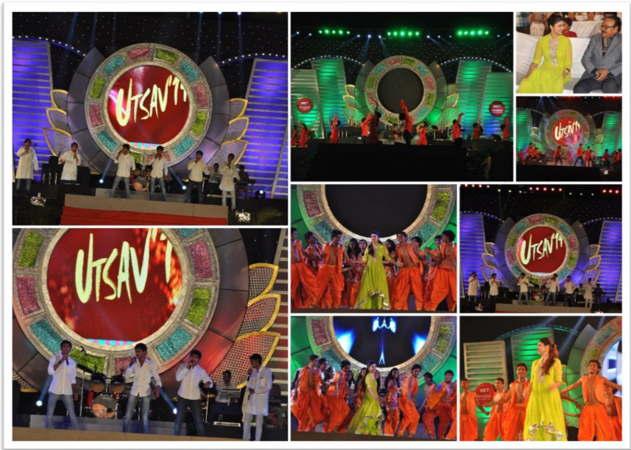
Students' Performances at UTSAV'14