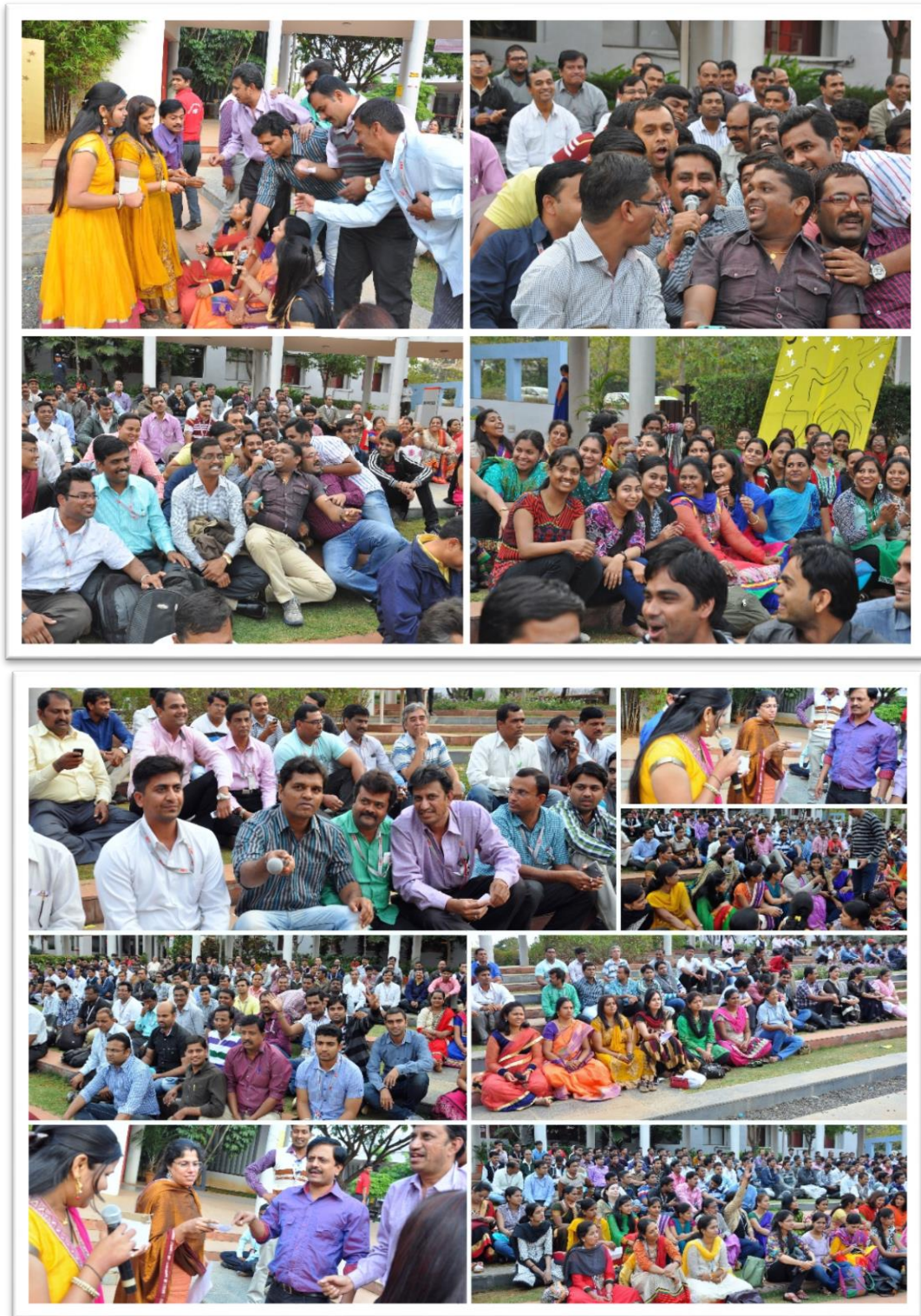
Staff Entertainment Day Celebration