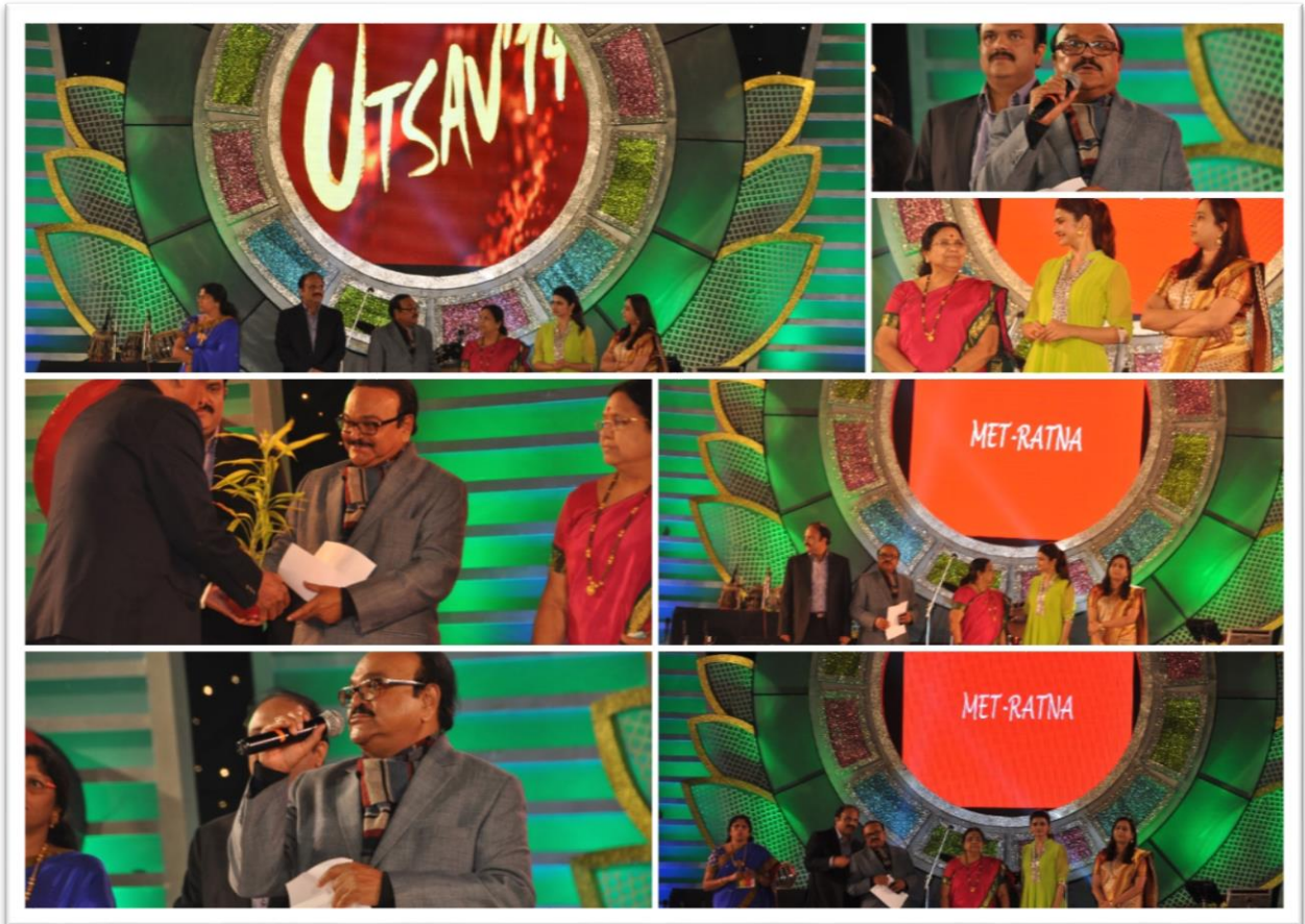
MET RATNA Awards Distribution